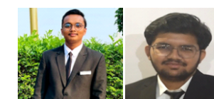
BY: AYUSH BHATI & SAJAL JAIN B.A LLB 1ST SEMESTER Indore Institute of Law

Blame game is still on the international side but this warfare is using refugees, who are helpless people that left their conflict-ridden countries to save their lives are now use as weapons and stuck in a political warfare without no help and shelter given to them. United Nation and European Union must try to help them in this situation and take steps to stop this type of hybrid warfare where innocent lives are used.