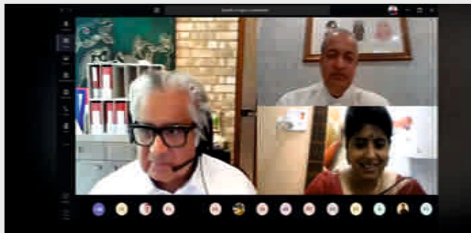
Sr. Adv. Harish Salve, Supreme Court of India Addressing at Valedictory Ceremony.

• President Ram Nath Kovind promulgates two ordinances - President Ram Nath Kovind on 14 November 2021, promulgated two Ordinances to extend the tenure of Directors of the Central Bureau of Investigation (CBI) and Enforcement Directorate (ED) up to 5 years. The Ordinances are, the Central Vigilance Commission (Amendment) Ordinance 2021 and the Delhi Special Police Establishment (Amendment) Ordinance 2021.