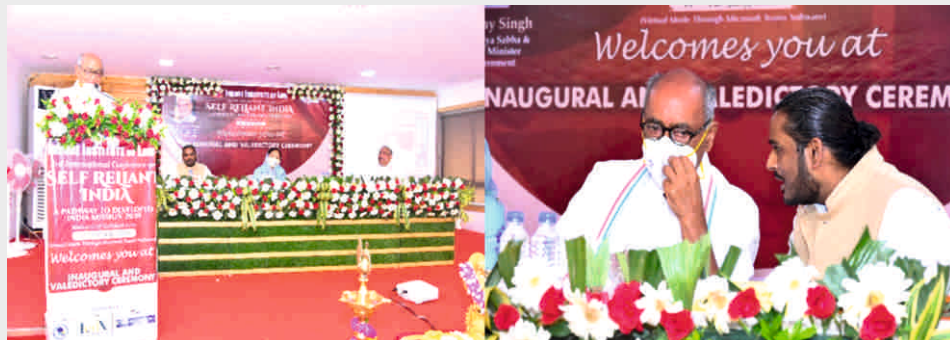
Mr. Digvijay Singh , Member of Parliament, Raj Sabha & Former Chief Minister, Madhya Pradesh.

“Self-Reliant India” A Pathway to Developed India Mission 2030 Return of Golden Era