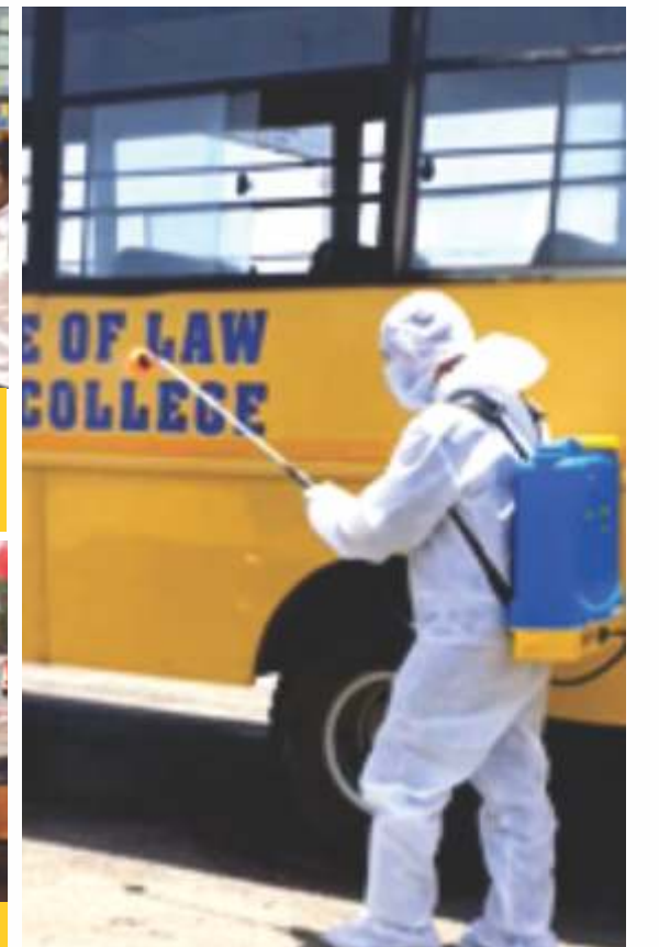
Sanitizing the buses as safety is our priority.