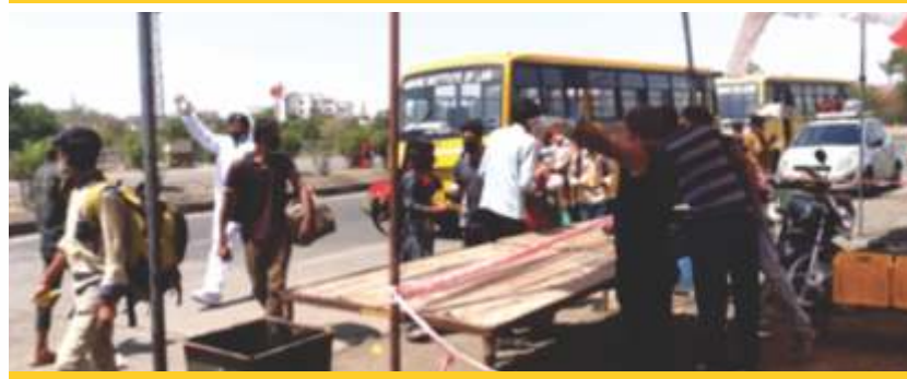
Ever since the lock down was announced migrant laborers have been one of the worst hit groups. Indore Institute of Law has come forward at this time of adversity and sets up camps to help these groups.

We have not compromise with the safety and followed government guidelines. Provided safety kits to every person, who was assisting us to help the worst hit groups.