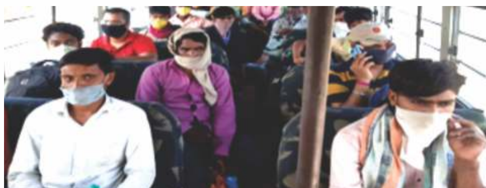
Arranges buses to ferry daily wagger migrant to help them to return their home safely.

For publication and advertisement related queries mail us at - publications@indoreinstituteoflaw.org