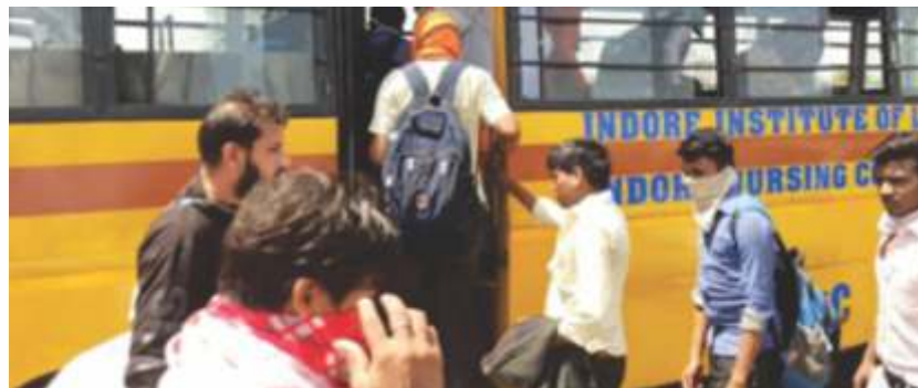
"Relay Support" a transport initiative by Indore Institute of Law wherein the institute provided their vehicles to help the migrant works reach the home safely.